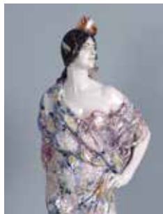
Mariano Benlliure: Chula