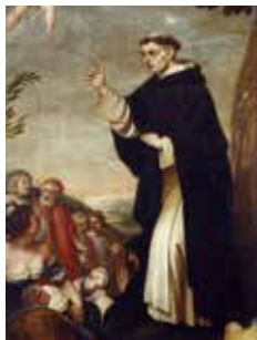
Alonso Cano: St Vicente Ferrer Preaching