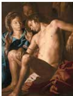
Matthias Stom: St Sebastian Nursed by St Irene and Her Maid