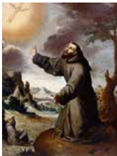
Bartolomé Esteban Murillo: St Francis of Assisi