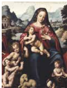
Joan de Joanes: The Virgin of the venerable Agnes