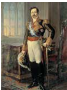
Vicente López: Portrait of general Ramón Narváez