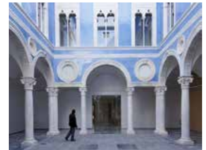
Ambassador Vich Courtyard (ca. 1525)