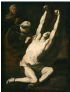
José de Ribera: St Sebastian Nursed by St Irene and Her Maid