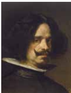
Diego Velázquez: Self-portrait