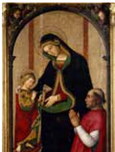
Bernardino di Benedetto di Biagio, "Il Pinturicchio": Virgin of the Fevers