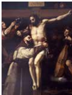
Francisco Ribalta: St Francis of Assisi Embracing Christ Crucified