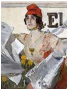
Joaquín Sorolla: Sketch for the poster for El Pueblo newspaper